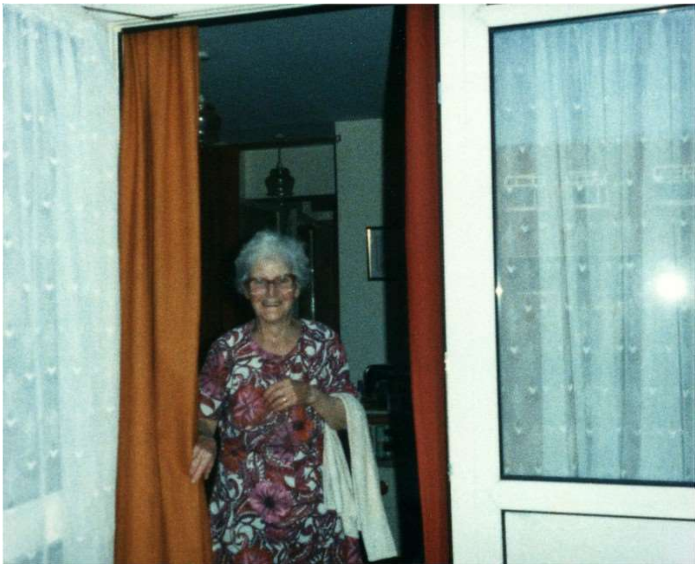
This is probably the most recent photo of Grandma as it looks like the British Legion flat which she moved to after Grandad died. It was taken in September 1990.