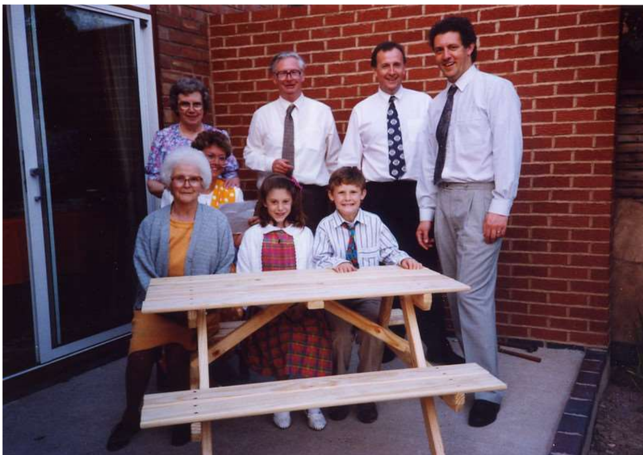
On Dad's 60 th birthday, 15 th May 1990. I must have taken it.