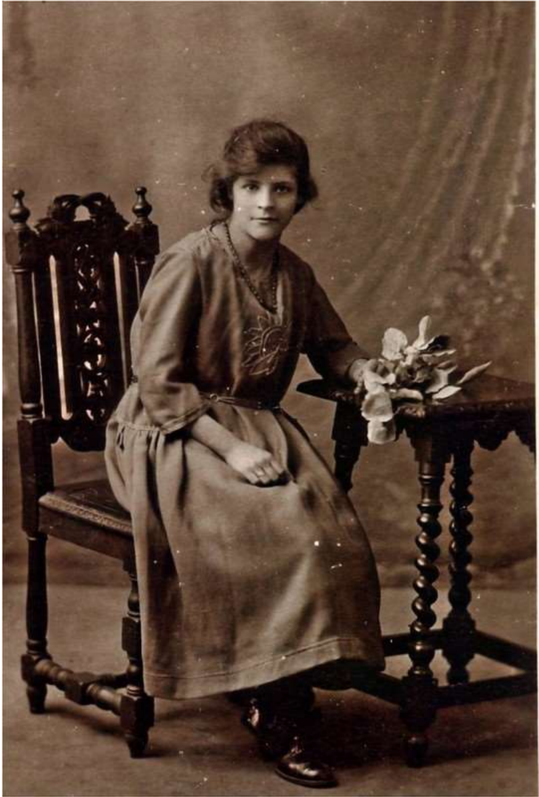
Is this Grandma? It looks too old! Maybe it is her mother (Little Gran)