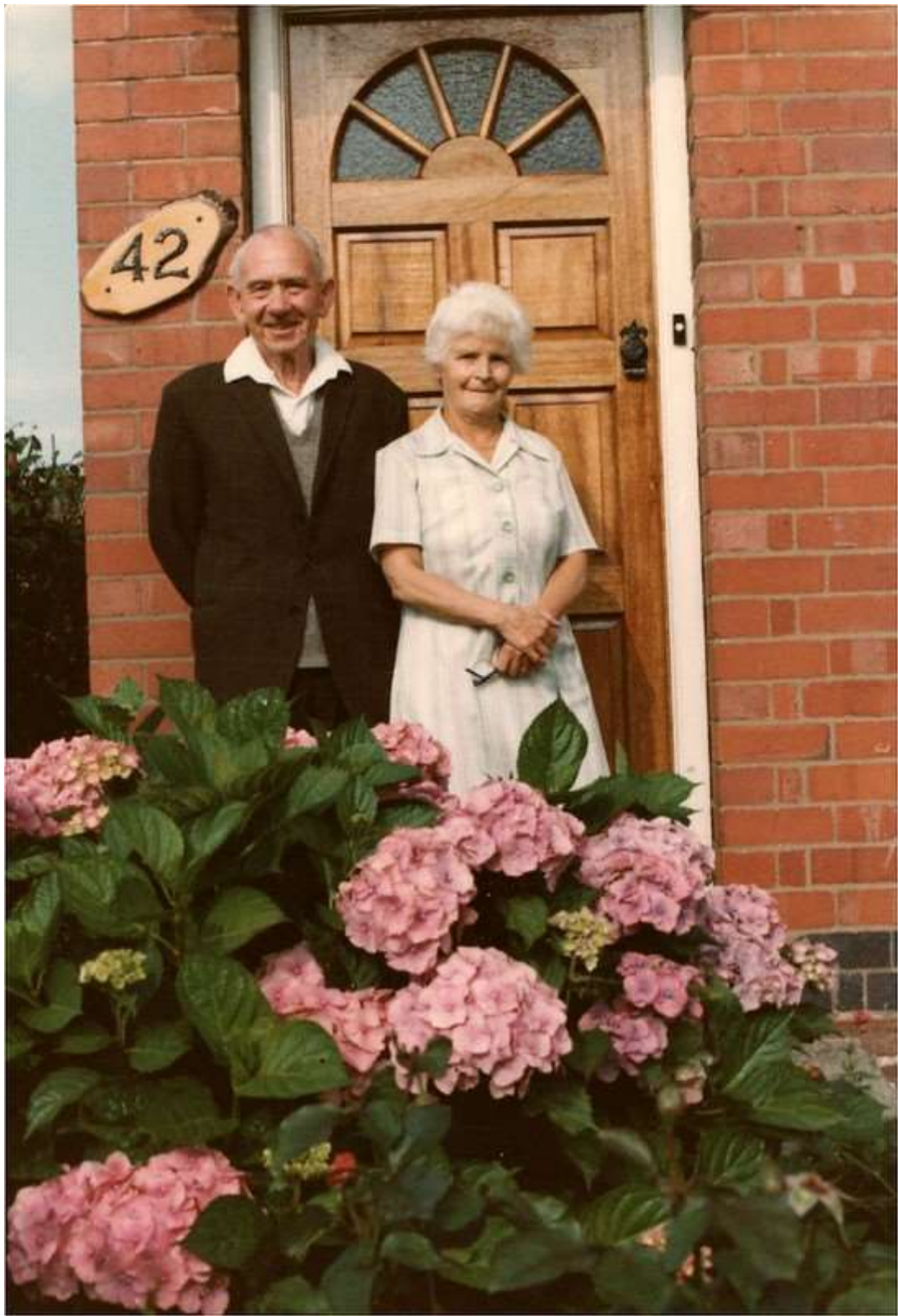
I remember that Mum and Dad bought this door for Grandma and Grandad for their Golden Wedding in 1977. This photo was taken 26/8/79.