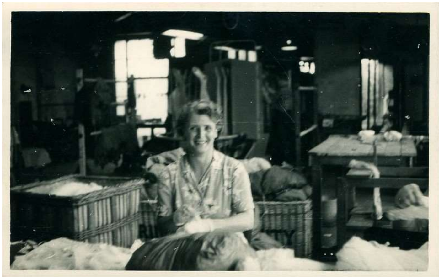
This is a photo of Grandma when she worked at Atkins hosiery factory in Hinckley.