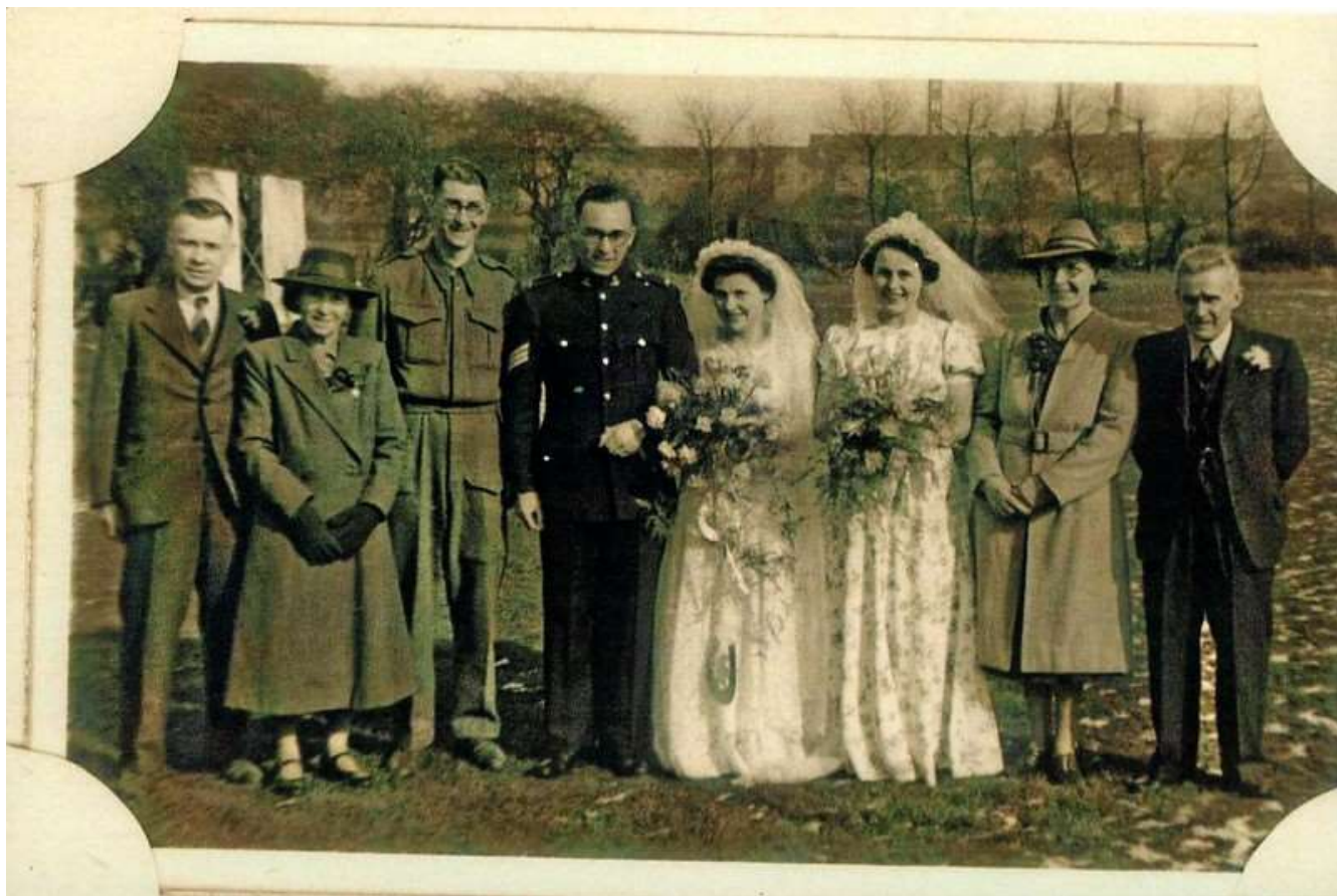
I think this photo and the one below are Uncle Ben's wedding. I think Uncle Ben lived in Saltash. I recall him visiting us once.