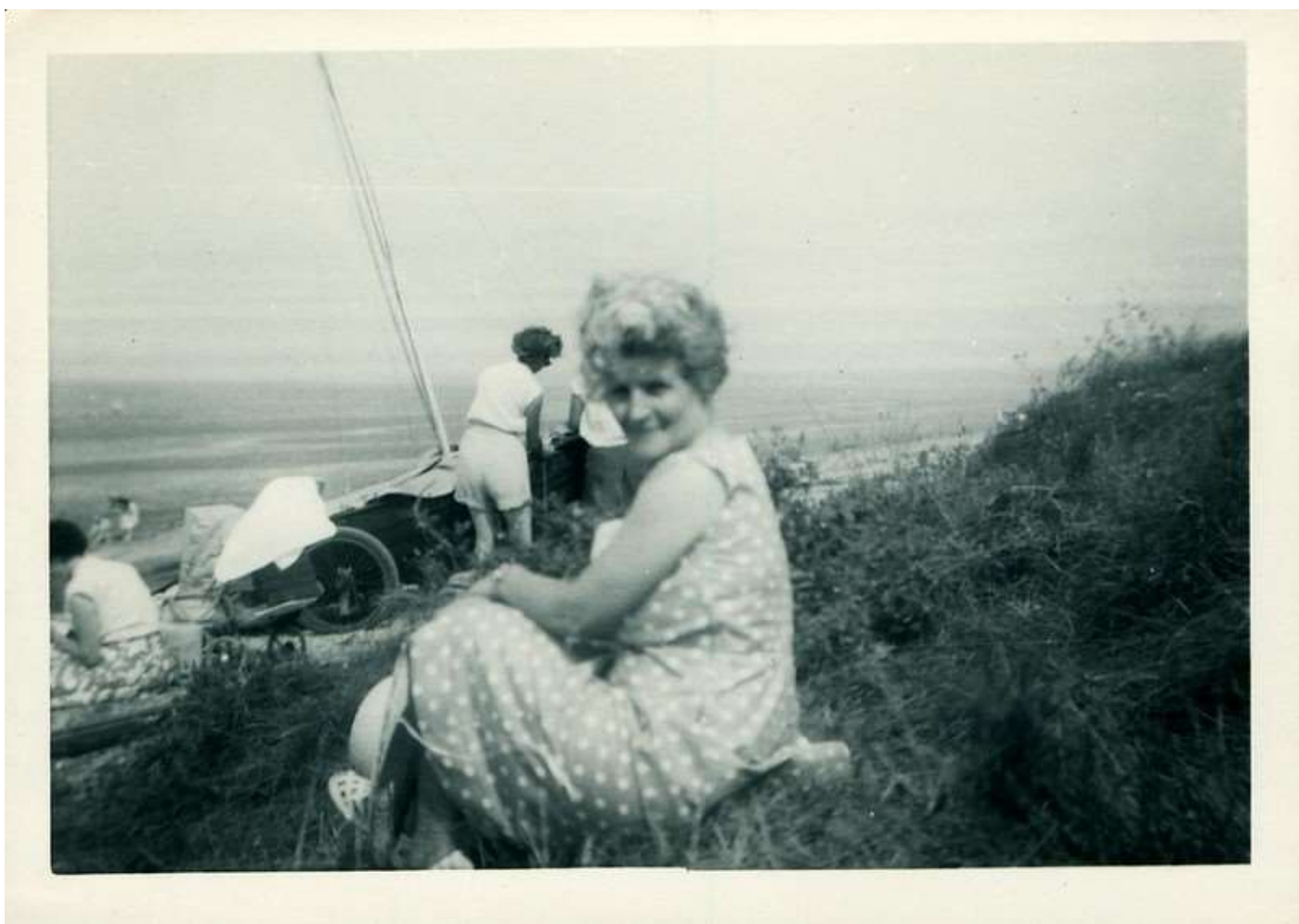
Seasalter, Kent, 1959