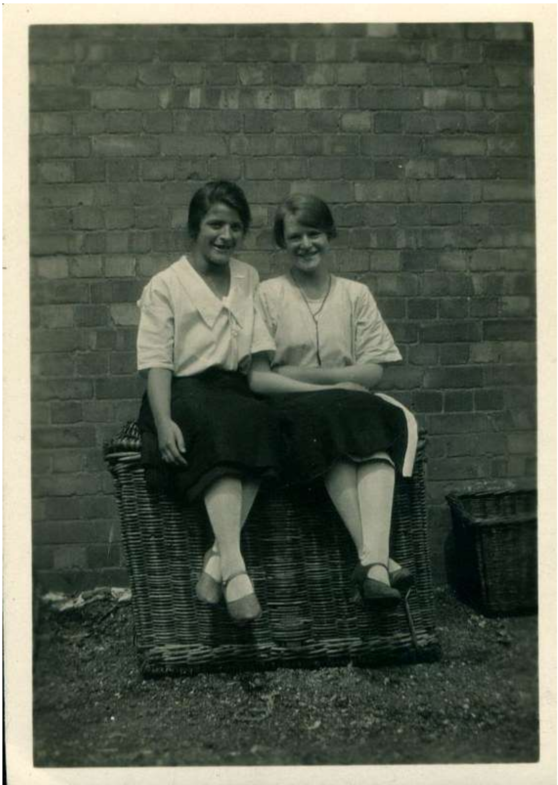
Grandma and ?